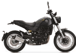
DARK MATT GREY