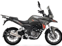
MATT GREY MET