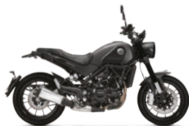
DARK MATT GREY